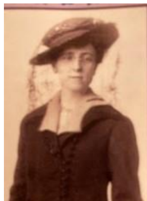
Lucy Maud Montgomery