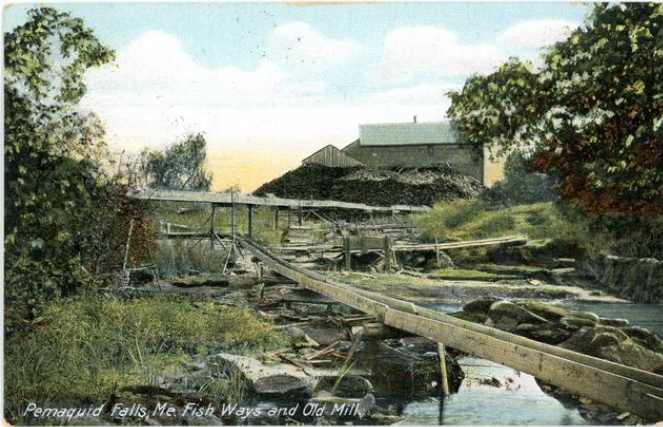
Pemaquid Mill, 1910 (from the west-back side with alewives fish ladder)

As the alewives begin their migration upstream in the Pemaquid River and as the osprey enjoy their splendid fish banquet, we are writing our Spring Newsletter to share the progress, hopes, and gratitude that continue to inspire our work and mission at the Old Bristol Historical Society. So much has happened in the past few months. It has happened because of the generosity of so many of you. We are grateful for the 300+ donors who have contributed to our Annual Appeal. Your gifts have enabled us to begin our major projects: