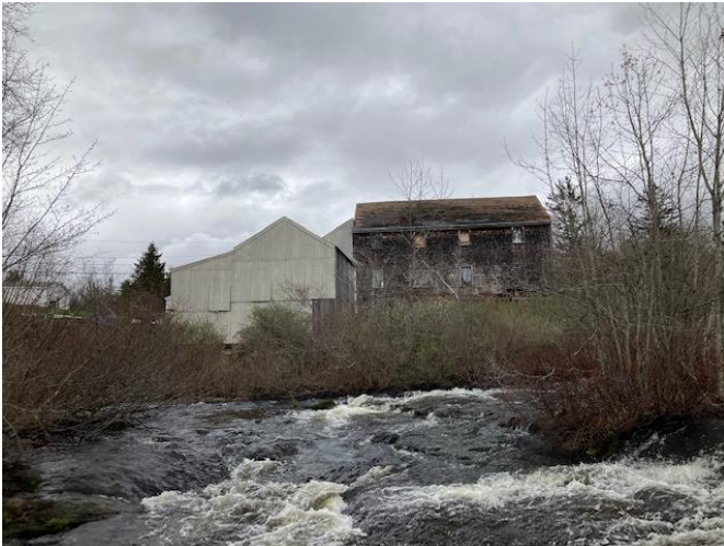
Pemaquid Mill, 2021 (110 years later)