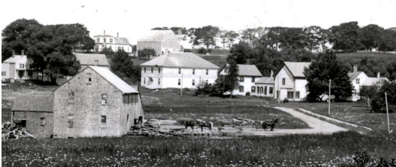
The Village of Pemaquid Falls ca. 1910