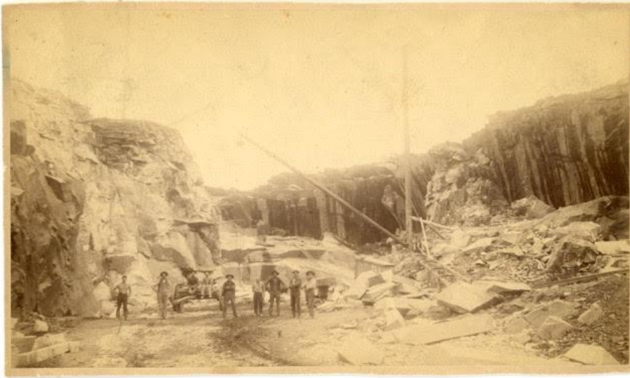
Round Pond Quarry, 1890