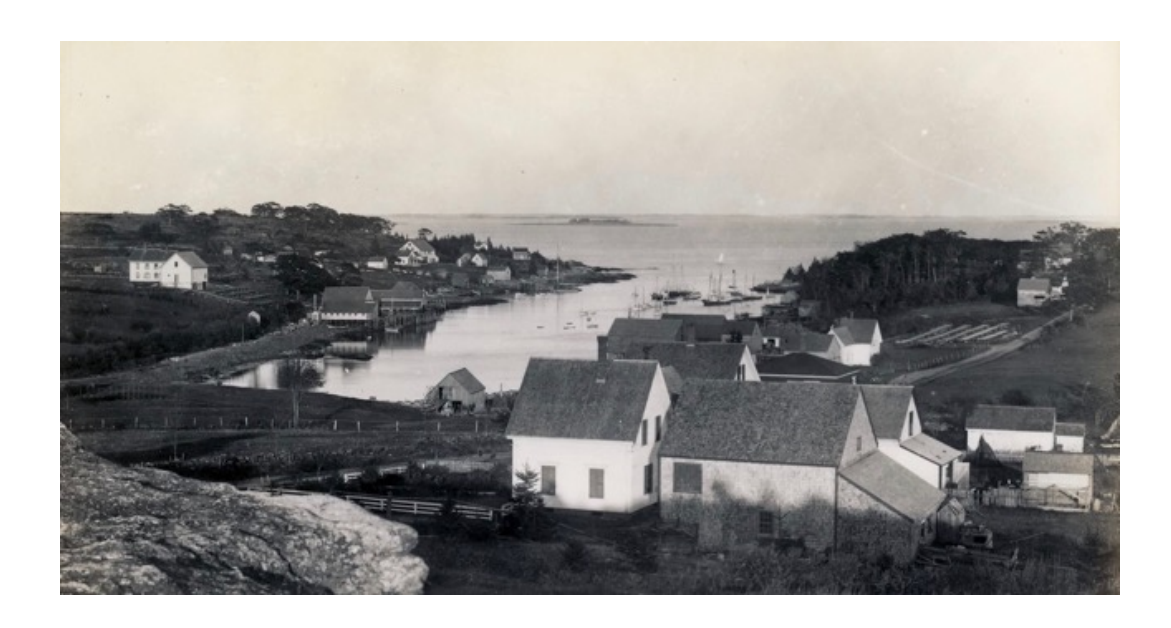
New Harbor, Maine, c. 1910