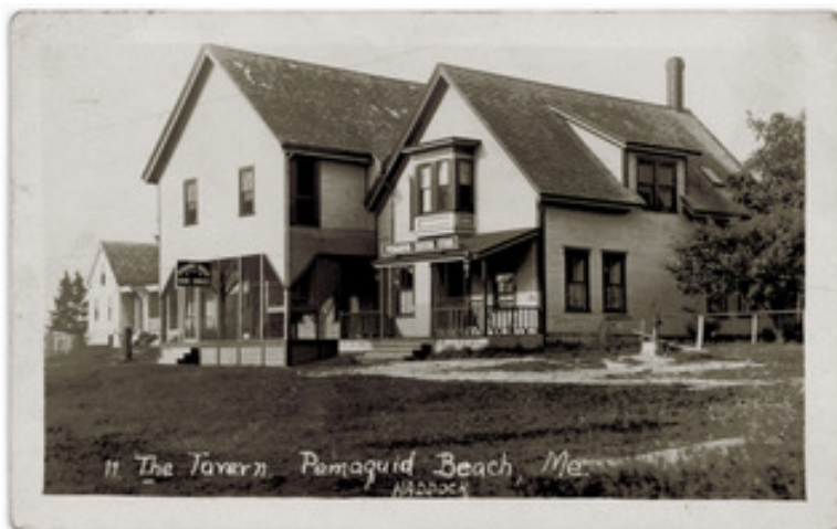
Photographic postcard c 1922.

OBHS is pleased to invite the public to view our new gallery exhibit that will focus on Bristol stores of the past. The exhibit, titled Supplies, Sundries & Sustenance: The Stores of Bristol, 1855-1970 , will look at a sampling of stores, their owners, and their images by drawing upon items and images found in our collection or loaned from the Bristol community.